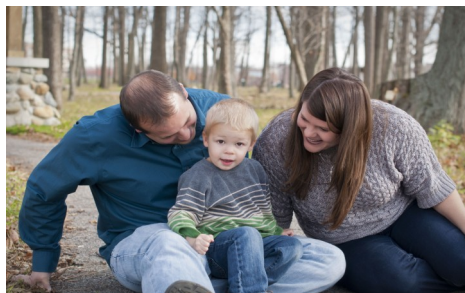
The Delp Family