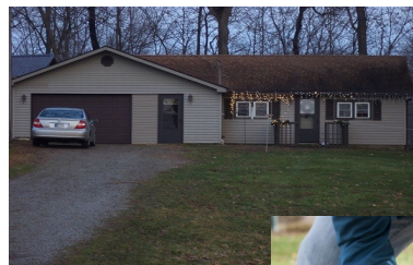
The Blessing of a new Home...