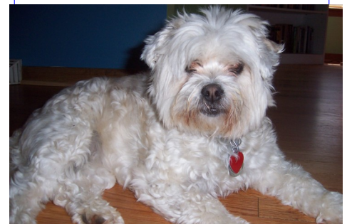
We translated that of course!