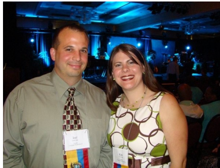
Commissioning Service 2009