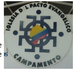
The Covenant Camp Logo

-Darrel L. Bock, NIV Application Commentary - Luke