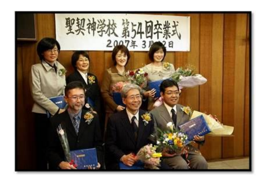
Last year's Covenant Seminary graduates.