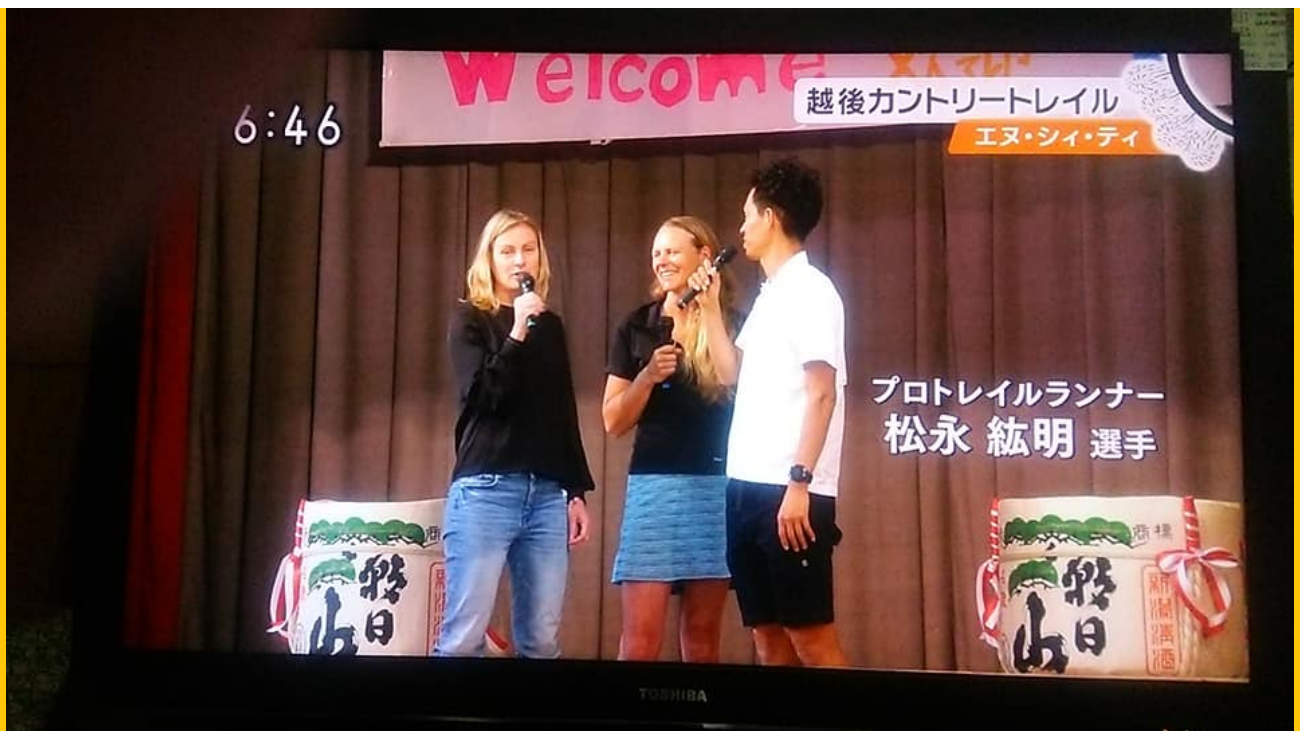
Interpreting for the guest runner from France and race director on local TV!