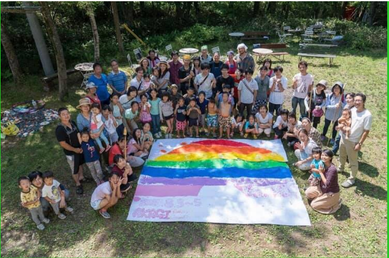
Covenant Family Camp