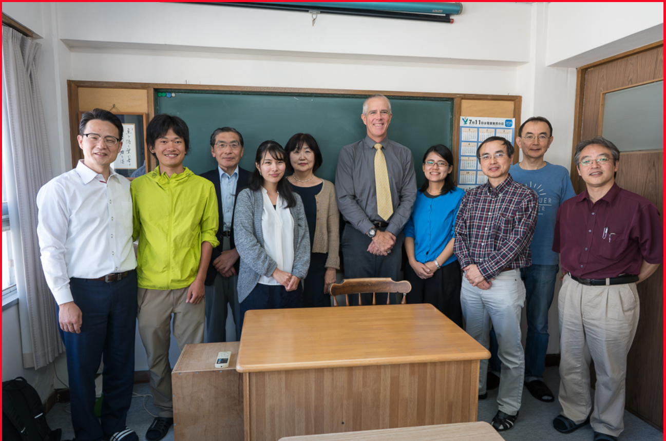
The Pietism class