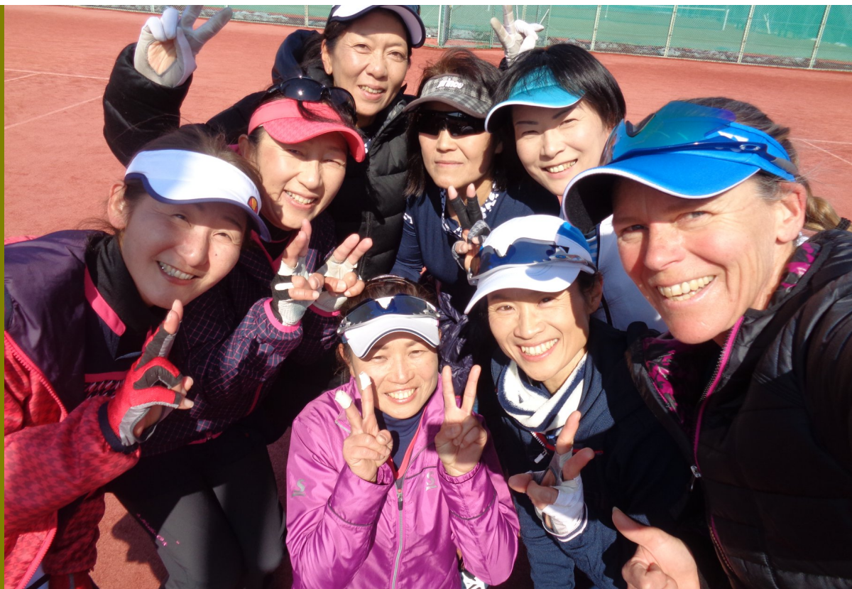
The Gunma prefecture team is victorious against Tochigi prefecture at the Valentine Cup