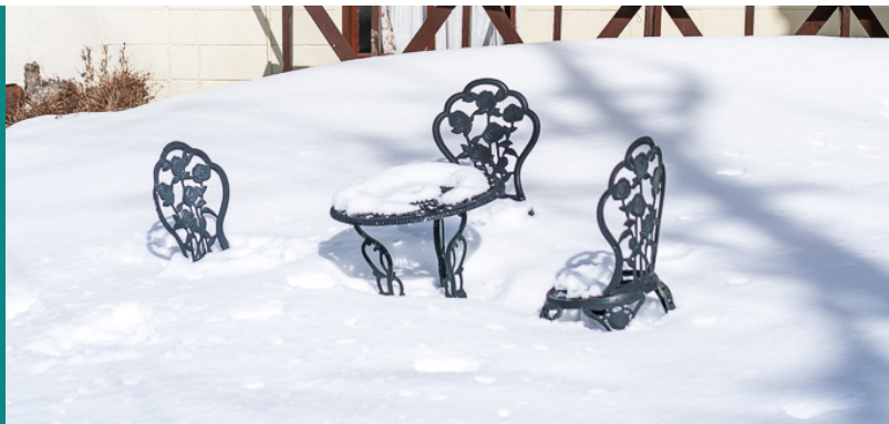
Akagi Bible Camp in the winter