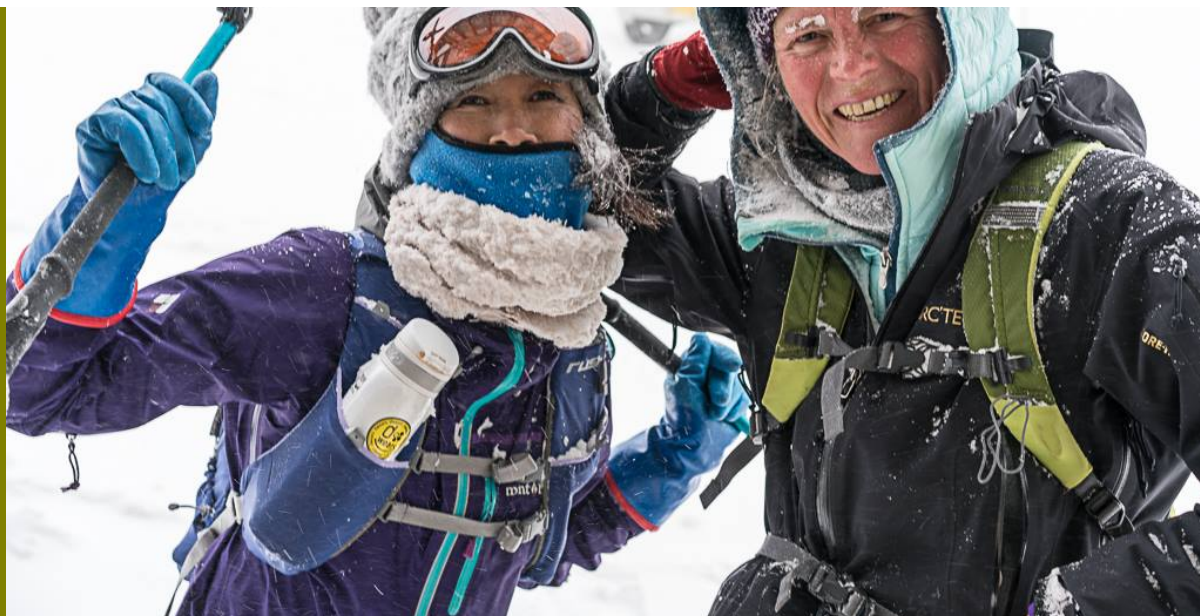
Snowshoeing the trails of Mt Akagi with a dear friend in a blizzard!