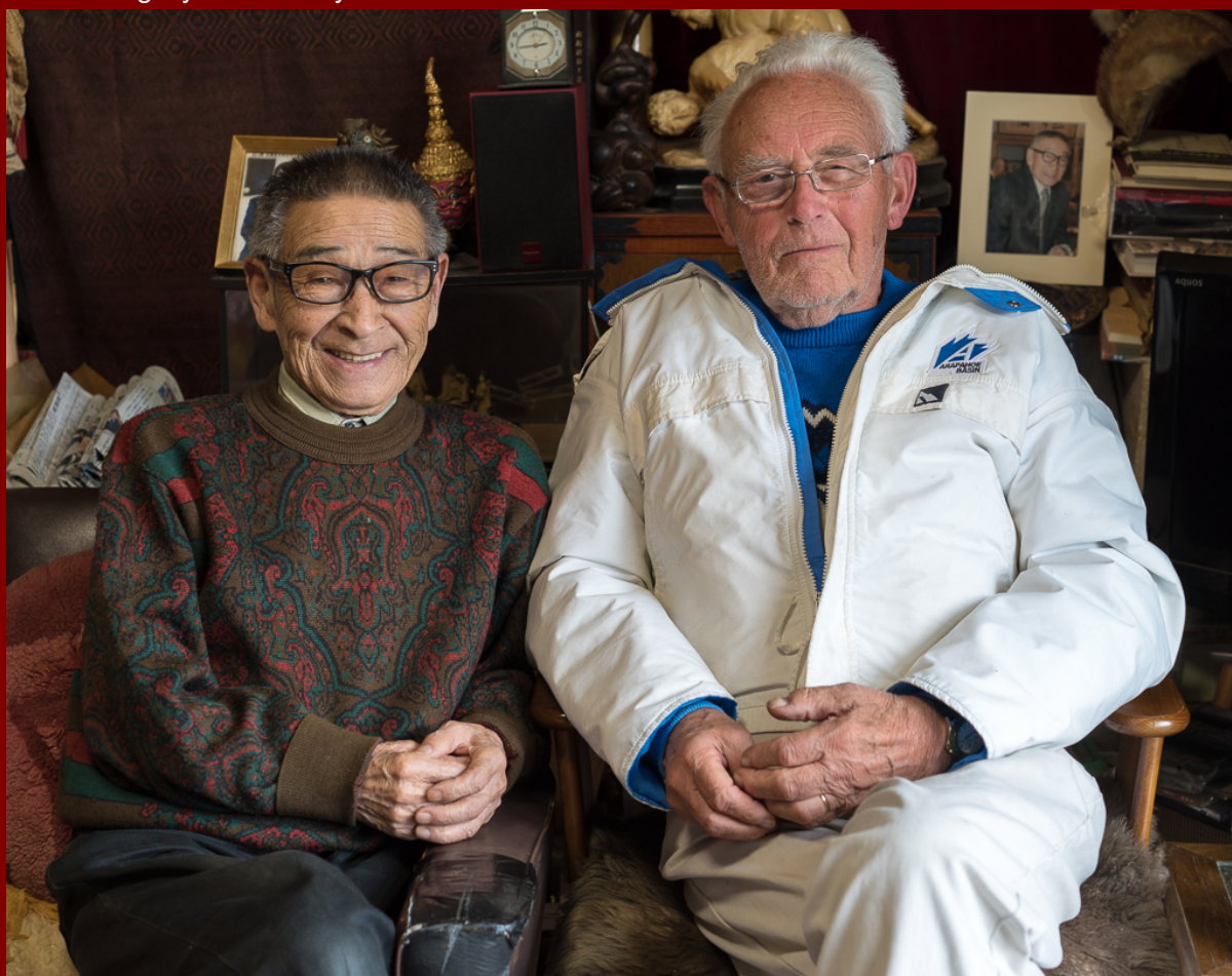
Reunited with a childhood friend