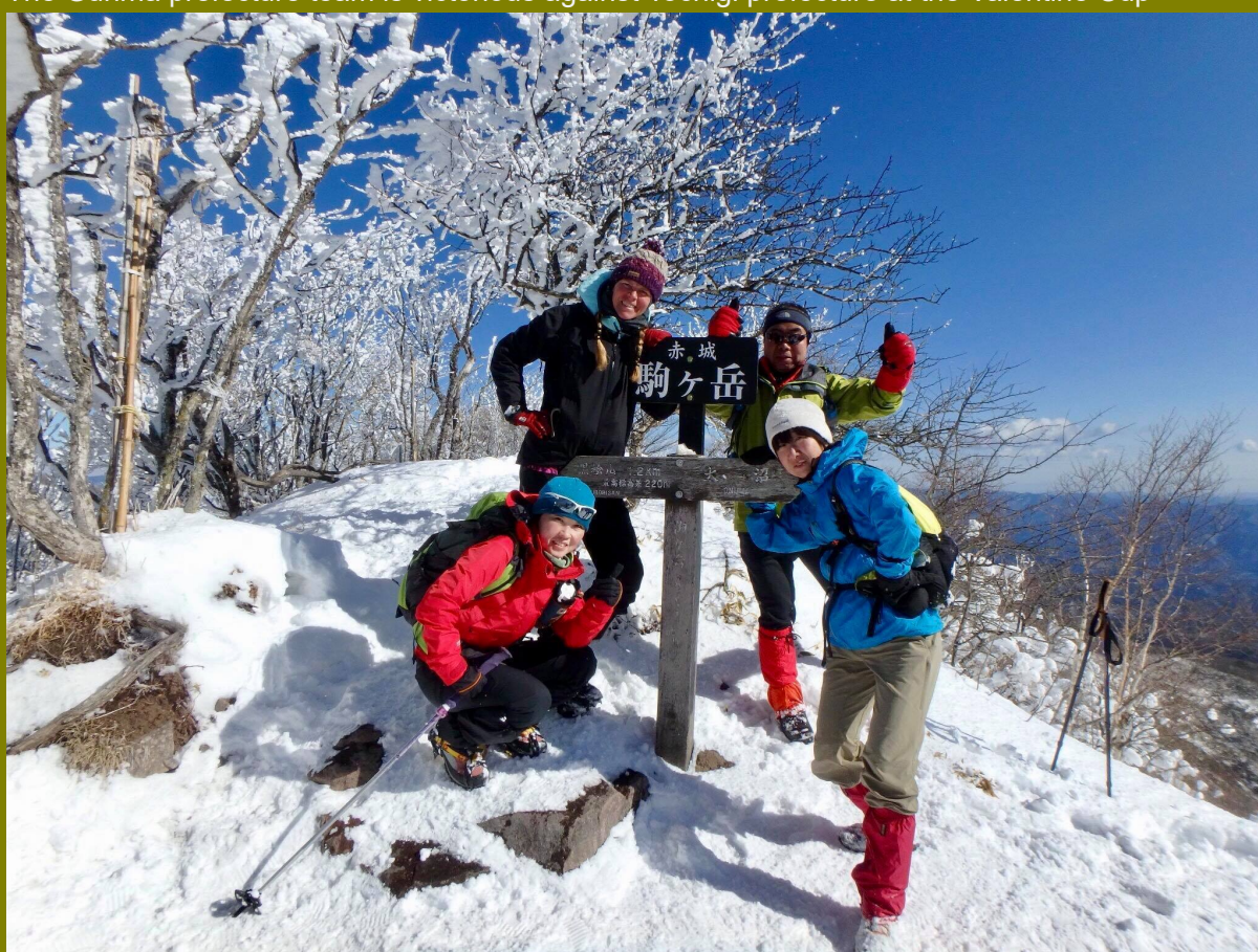
Guiding new friends from Niigata prefecture to the summits on Mt Akagi