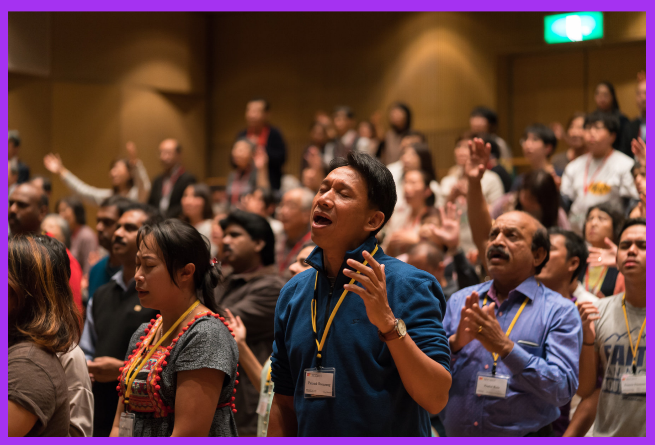
Worshipers from eight countries finding a common language in song