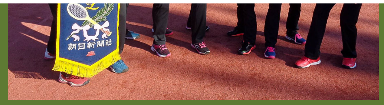
Hydi and the Gunma Prefecture team at the National Ladies Tournament