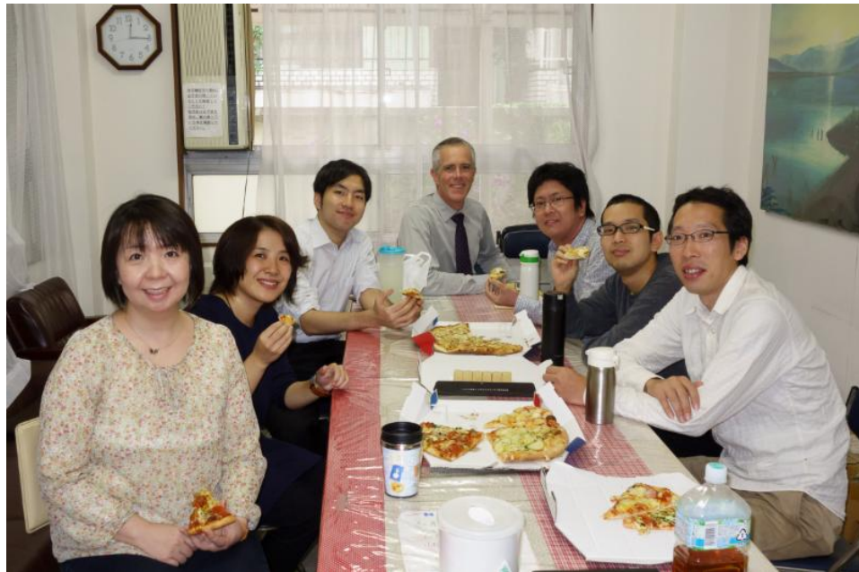
A group of very gifted up and coming preachers enjoying a pizza lunch!