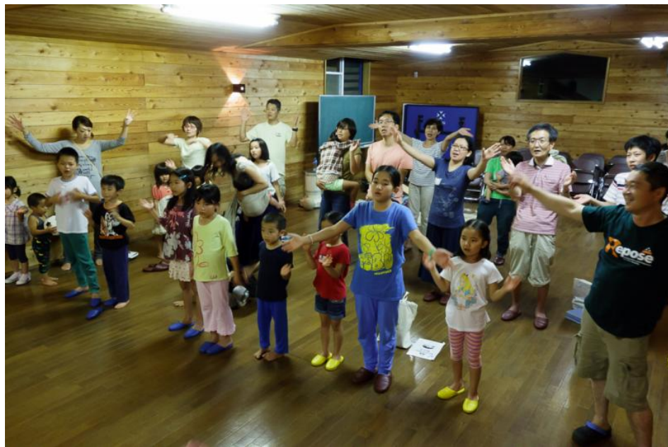
Young Family Camp

This summer we hosted four camps in July, five in August and one in September. This was a modest increase from our first season at Akagi Bible Camp but the biggest growth was in spring and early summer. We had two groups in April, two in May and two in June. Living onsite was the key to this growth and we pray for increased use of the facility throughout the year.