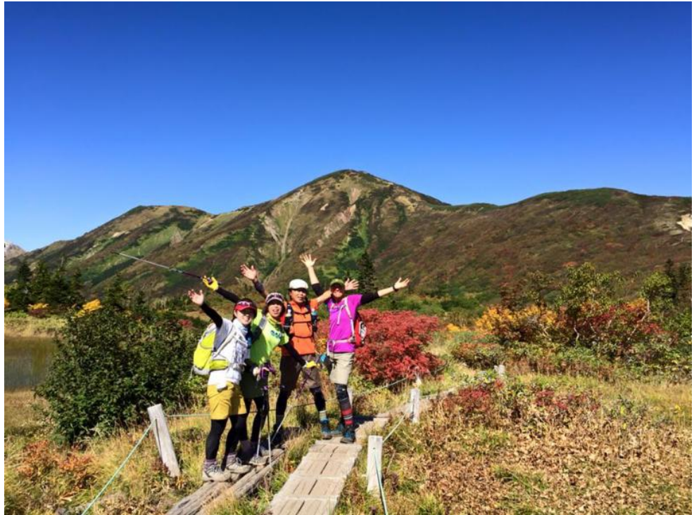
Climbing Mt. Hiuchi