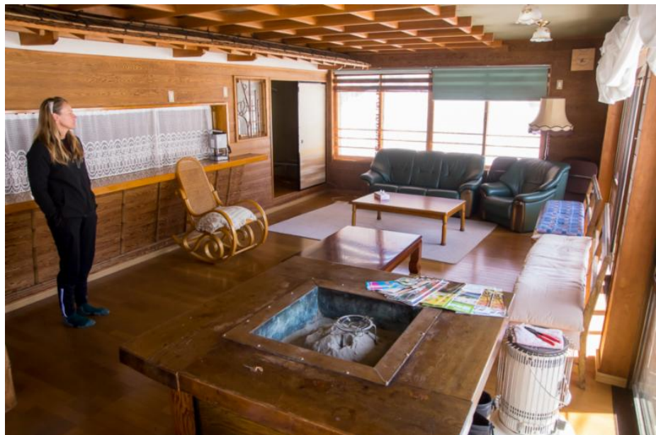
Checking out our new livingroom