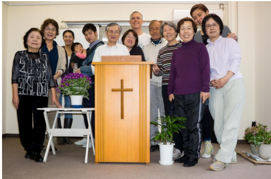
Posing for a group shot after the move!

We have asked you to pray with us as Grace Mission Church has been looking for a new place to worship. God has answered those prayers and provided a wonderful place that fits our limited budget and gives us far more space than we had before. We are renting the second floor of a four story building. The first floor houses a post office and the owner lives on the third and fourth floor. Renovations have been completed and we moved everything to the new place on March 30th after the morning worship. April 6th will be the first Sunday worship at the new location.