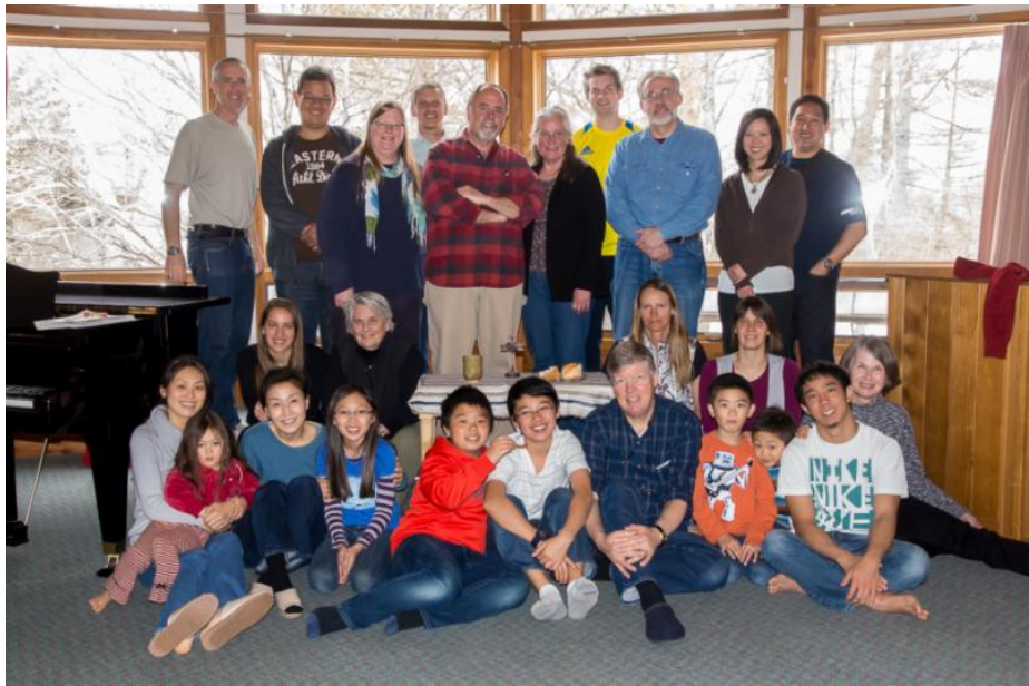
Our Mission Family in Karuizawa

During the first week of May the Japan Covenant will be holding the annual Covenant Refreshing Camp in yet another mountain town called Hakone. Folks from all of our churches will be coming together for several days of fun, fellowship, praise and learning. Please pray that it will be an encouragement since so many of our Japanese brothers and sisters rarely get to be in large groups of fellow believers.