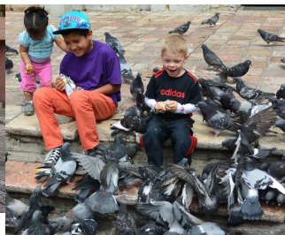
A trip to Cuenca