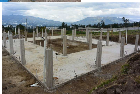
Home Construction Work progress