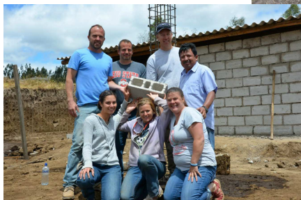
Partnership in ministry