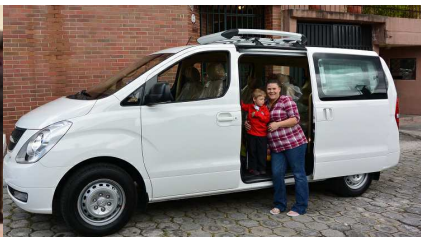
A wonderful vehicle for ministry