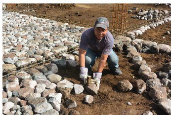
Help from friends close by