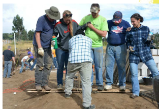
Help from friends from far away