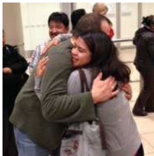
Being welcomed in the airport