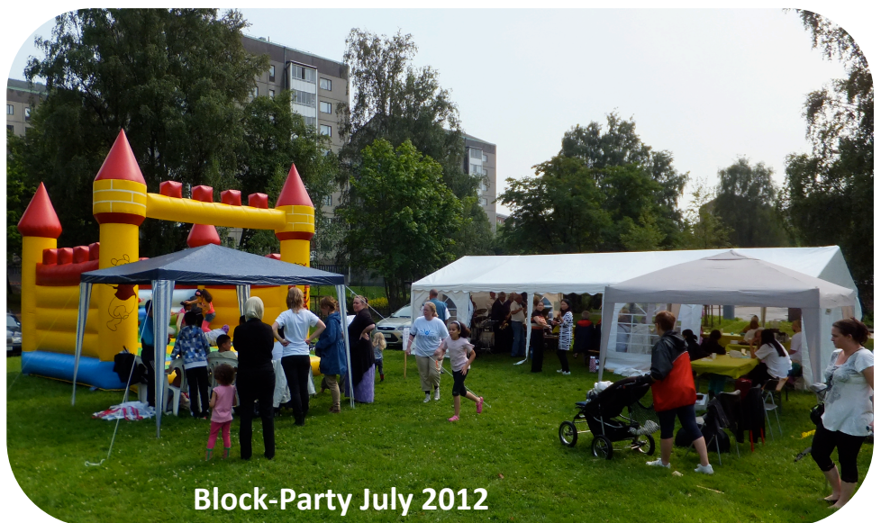
Block-Party July 2012

The church-plant is a year and half old now and already we have had: Communion/worship services, The Alpha Marriage Course, a Block-party, prayer & fasting days for Brunnsbo, started several new small-groups, been in conversation with the local authorities (police, school, landlords, social workers and mayor), working with the neighboring churches, started a language café which is every Monday to help immigrants learn Swedish, and seminars on spiritual gifts and discipleship. Check out Brunnen's website if you would like to know more: www.brunnen.cc . God has been doing a lot in and through Brunnen, I wonder what next year will hold...your prayers and gifts help, big time! Just think, you have a roll in expanding God's Kingdom!